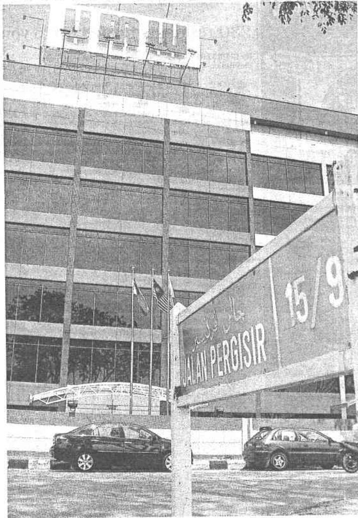
Handy tools: Jalan Pergisir in Section 15. All road names in Section 15 are named after crafting tools.

She added the system had been in use since the early planning of the city.