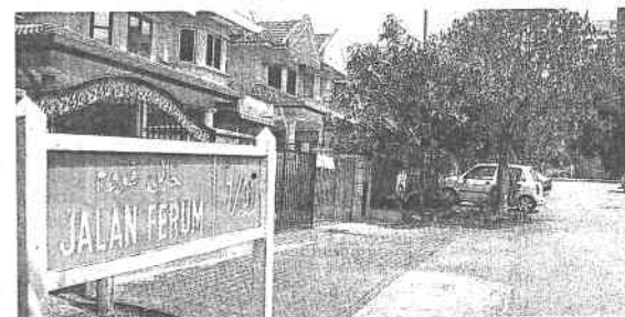
The metal connection: Another road in Section 7 with Ferum or iron for its name